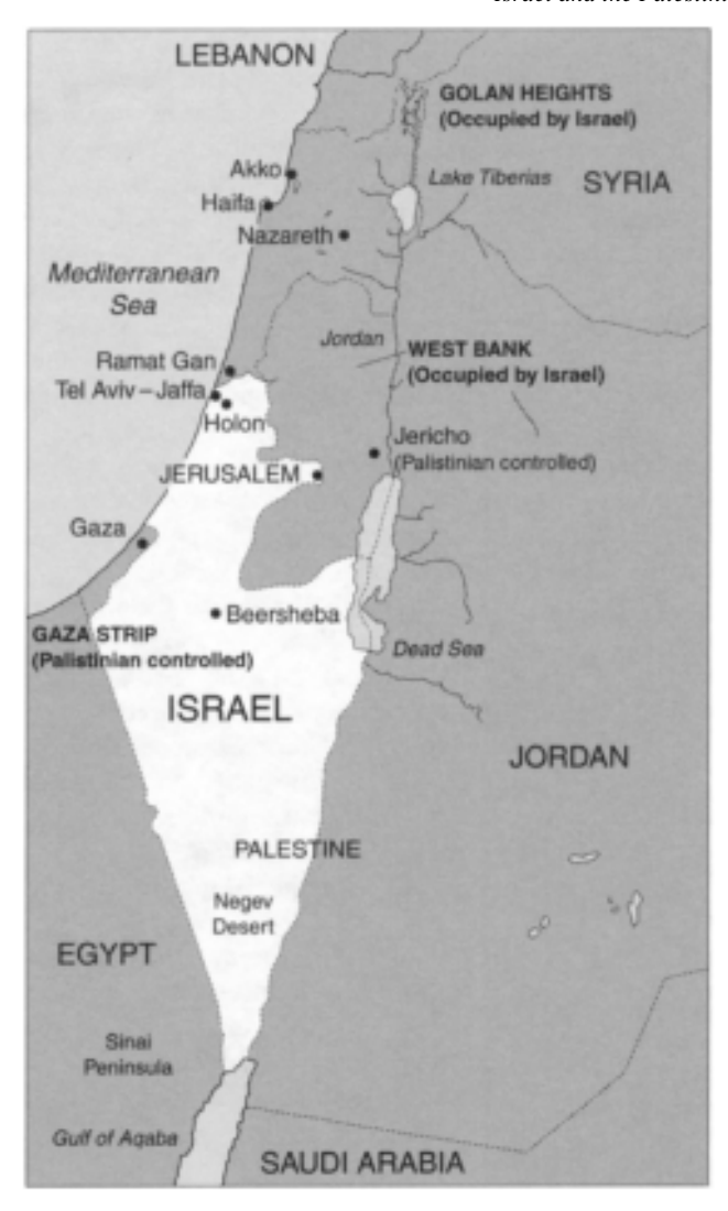
Map 3 Israel