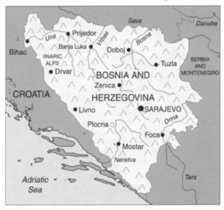
Map 4 Bosnia and Herzegovina